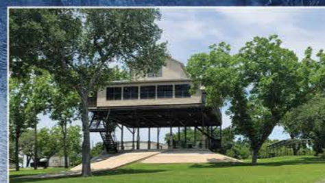
Riverfront Home on 1.38 Acres