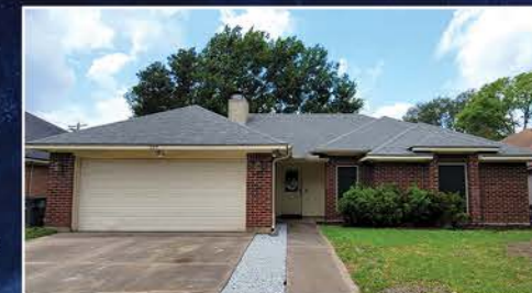
Charming Home in Bridle Ridge