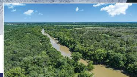
2 Acres on the Guadalupe River