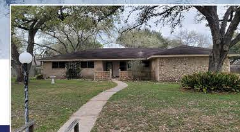
Corner Lot in Northcrest