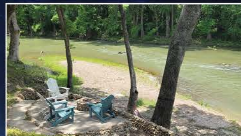
Riverfront Home on 1.2 Acres