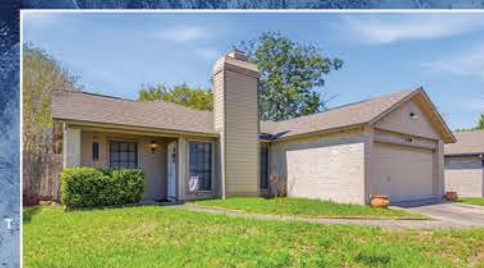
Updated Home in Fleetwood